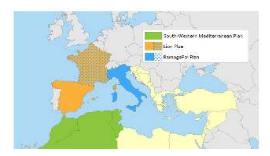
<u>Multilateral Agreements on Sub-regional Contingency Plans</u> in the West Mediterranean (Cedre, 2019)